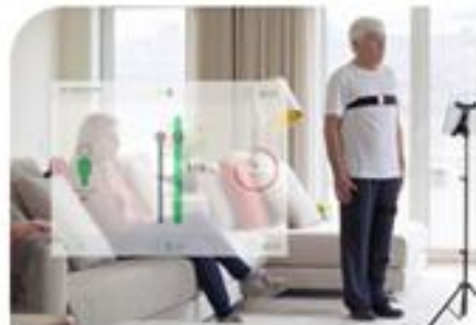
Sword Health (PT) Virtual care for patients Supported by EIT Health